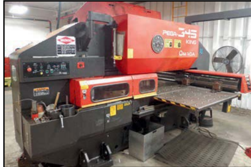
Amada Mdl. Pega 304050 CNC Turret Punch