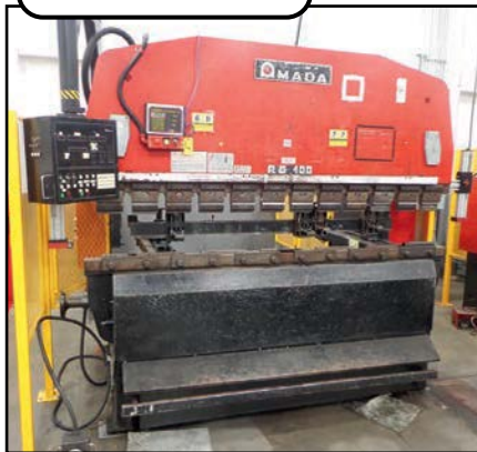
Amada Mdl. RG100S 8' CNC Press Brake