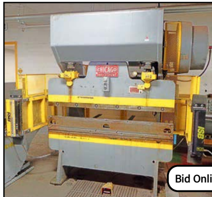
Chicago Dreis & Krump Mdl. 46L 6' Press Brake

• RIVET MACHINE: Emhart Technology Mdl. PSB40013 Portable Rivet Machine, S/N: 06244C (2006)