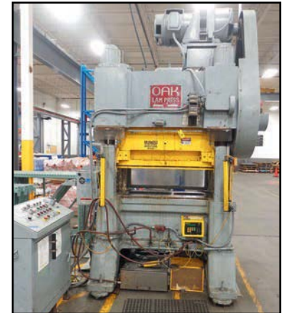
Oak Lam 62.5" x 22.5" Press