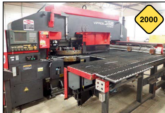
Amada Mdl. Vipros 358 King II CNC Turret Punch