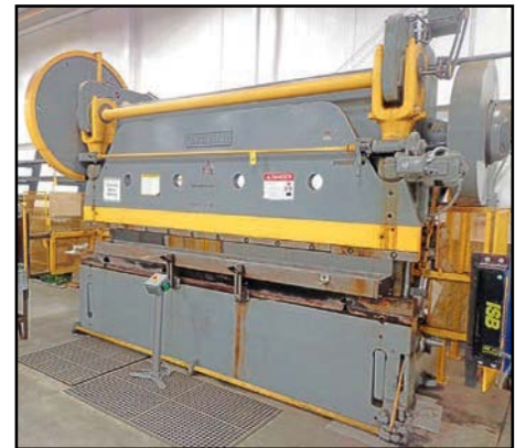
Cincinnati 12' Series 90X10 Press Brake

KOSTER INDUSTRIES AUCTIONEERS • APPRAISERS • LIQUIDATORS