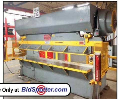
Chicago Dreis & Krump Mdl. 1012-L 10'4" Press Brake