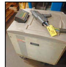
Emhart Technology Mdl. PSB40013 Portable Rivet Machine

VISIT OUR WEBSITE FOR TERMS & CONDITIONS, PHOTOS & MACHINE INFORMATION