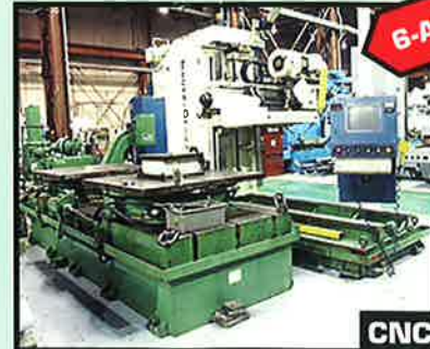
TECHNIDRILL 6-AXIS CNC GUN DRILL