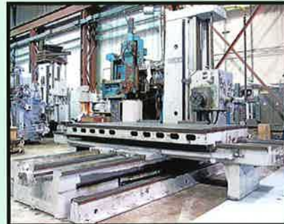
WOTAN 5-1/8" HORIZ BORING MILL

MACHINE TOOLS: CNC Hollow Spindle Lathes, incl. American 12.5" Hole Retrofitted 2012 • CNC 6-Axis Gun Drill • Horiz. & Vert. Boring & Milling Machines • Jig Mills • Large Cap. Hone & Grinders • E.D.M. • Engine & Hollow Spindle Lathes • Radial Drills • Accessories • Tooling • More. FABRICATING EQUIP.: CNC & Manual Press Brakes & Bending Dies • CNC Waterjet Cutting Machine (2012) • Plate Shears • Ironworker • Cut-to-Length Line • Welding • Plasma • More. MATERIAL HANDLING: Overhead Bridge Cranes, up to 150 T. x 88' span x 63' lift ht. • 10 T. X 70' span x 160 Gantry Crane System • Forklifts up to Taylor 52,000 lb. • Galion 15 T. Hyd. Telescoping Crane • Magnetic Lifters • Hoists. RAW MATERIAL: Sheet Metal • PARTS INVENTORY • PROCESSING: Vacuum Pump Liquid Extraction Ring. PLANT SUPPORT: Compressors • Work Tables • Fans • Heaters • Shelves. 1926 OAKLAND RARE ANTIQUE AUTOMOBILE • FURNITURE • MORE