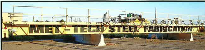
GAFFEY 10 T. X 70' SPAN X 160' L. TOP RUNNING DOUBLE GIRDER FREE-STANDING OVERHEAD BRIDGE CRANE SYSTEM

BIDS START CLOSING ON TUESDAY, DECEMBER 16 AT 10:00 A.M.