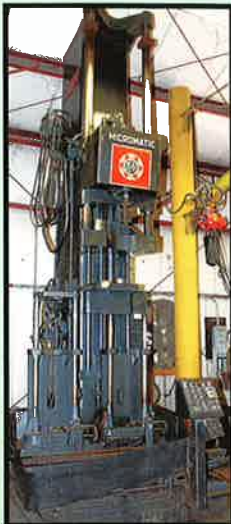
MICROMATIC MDL 15V65 LARGE CAPACITY VERTICAL HONE