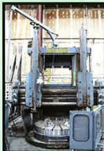
MORANDO 67" VERTICAL BORING MILL