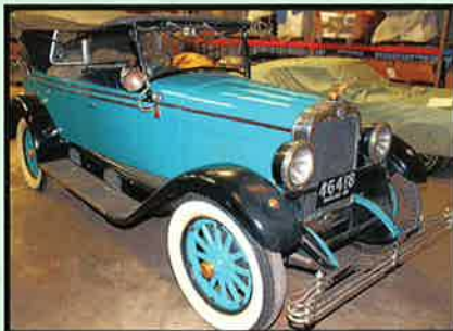
1926 OAKLAND 4-DOOR SPORT PHAETON RARE ANTIQU AUTOMOBILE

SEE OUR HUGE VIRTUAL BROCHURE ON OUR WEBSITE AT www.pmi-auction.com FOR SPECS, PHOTOS, LOCATIONS & INSPECTION INFO