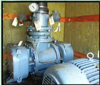
PARTIAL VIEW OF VACUUM PUMP LIQUID EXTRACTION RING PACKAGE

Presorted Mail First Class Mail U.S. Postage PAID Eugene, Oregon Permit No. 17