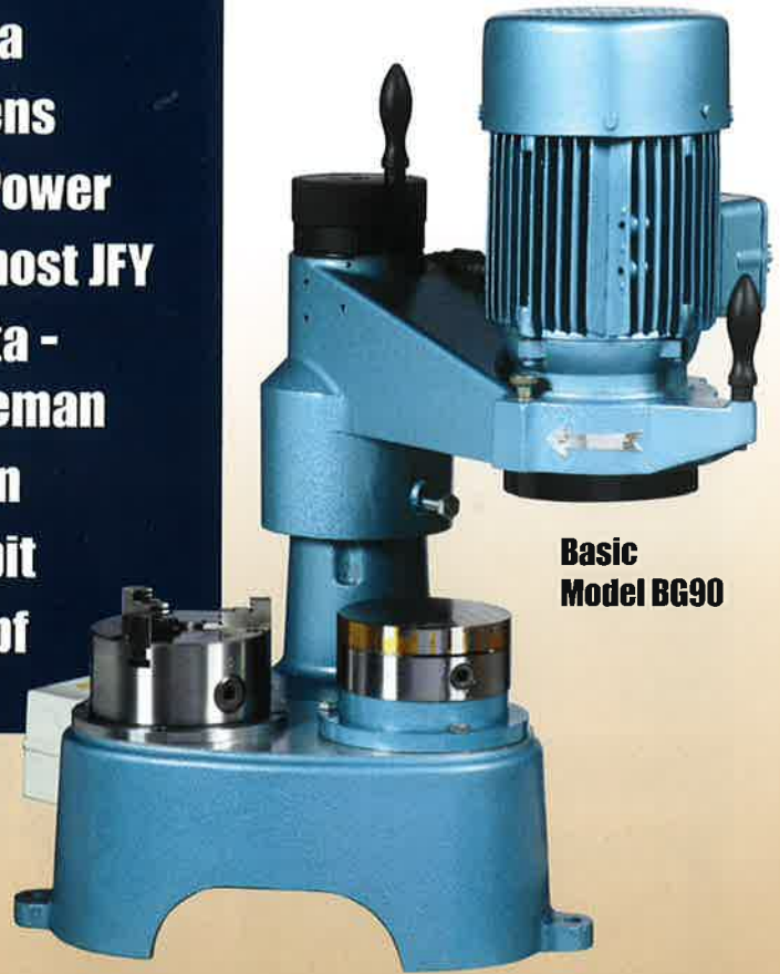
Basic Model BG90