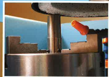
Optional tank and lube lines set up for wet grinding.