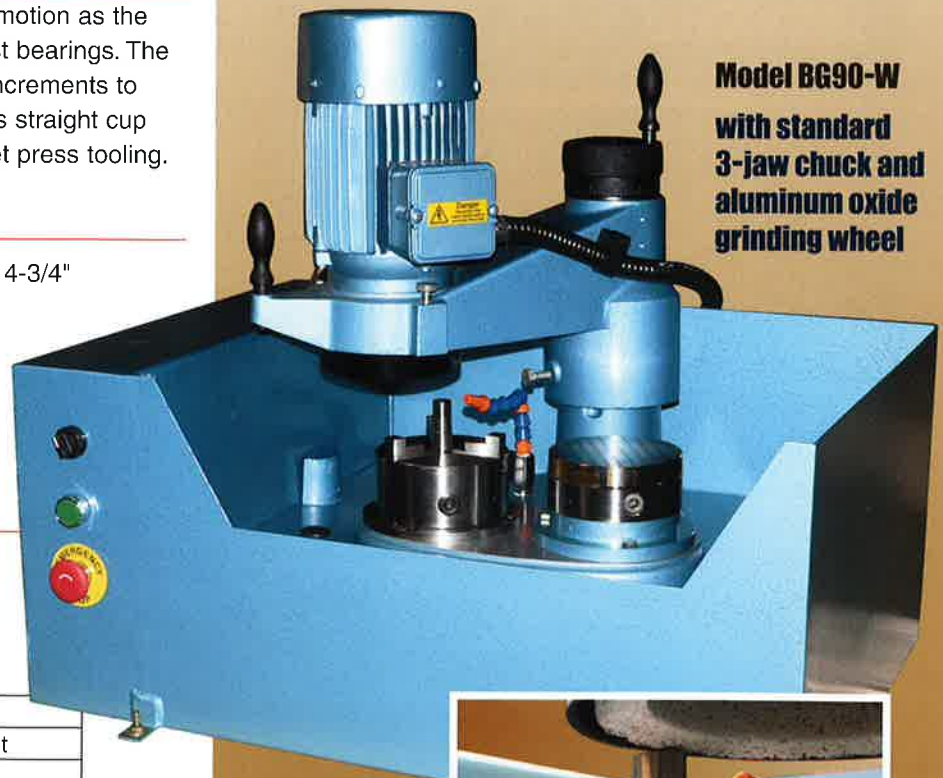
Model BG90-W with standard 3-jaw chuck and aluminum oxide grinding wheel