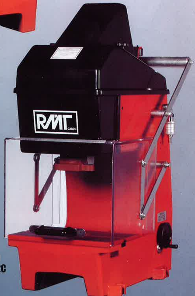
12-ton Model 12C