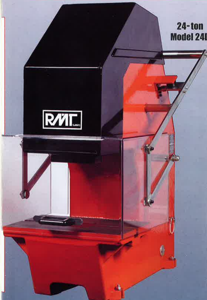
24-ton Model 24D

User must supply the valves and controls to operate the built-in 4 inch diameter, double acting cylinder