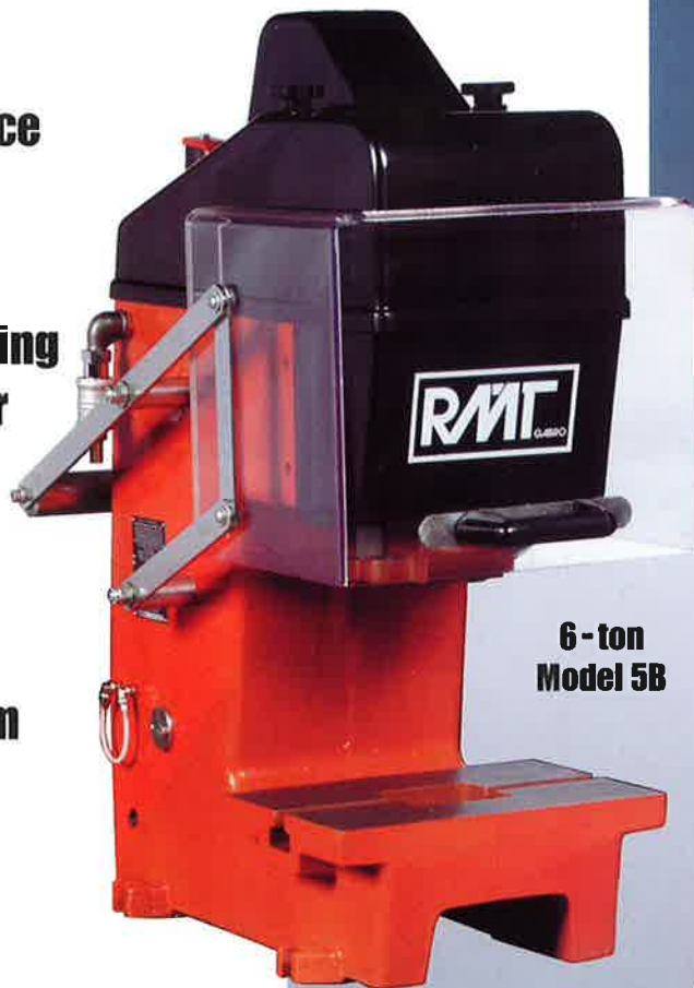
6-ton Model 5B